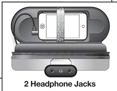
2 Headphone Jacks